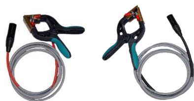
Test lead set with small TTA clamps