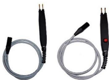
Test lead set with flexible duplex probes (one with trigger button)