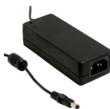
Power supply adapter