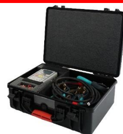
Transport case with accessories