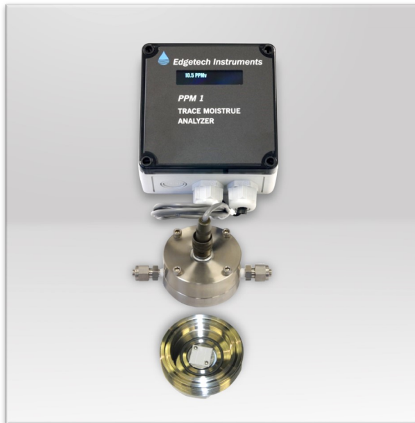
The PPM1 Trace Moisture Analyzer

All Edgetech Instruments hygrometers are manufactured and supported in the USA in a modern, ISO 9001:2015 registered, ISO/IEC 17025:2017 accredited facility. All calibrations and certifications are traceable to NIST.