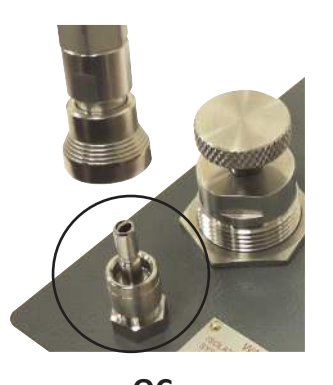
QC Quick Connector Push-On Type Fitting