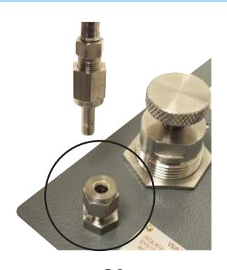
C4 1/4" Compression Fitting