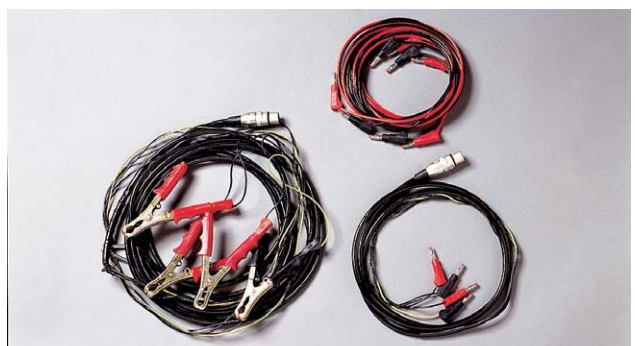
Multicable sets GA-00160 and GA-00170 and cable set GA-00082