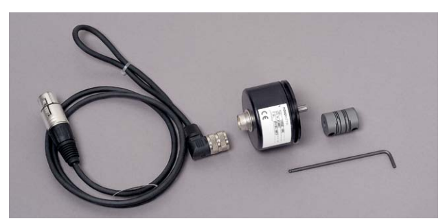
Rotary transducer, Novotechnic IP6501 (analog)