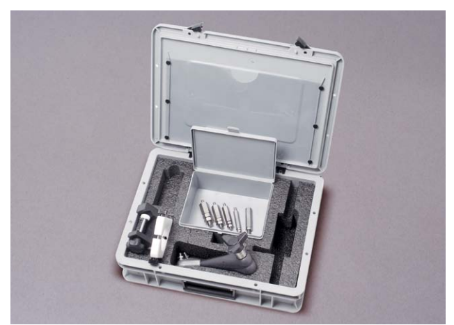
Rotary transducer mounting kit