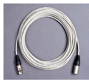
Extension cable XL, GA-00150