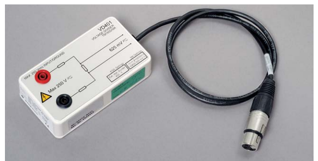
Voltage divider, VD401