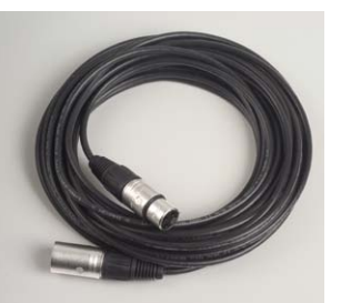
Extension cable XLR, GA-01005