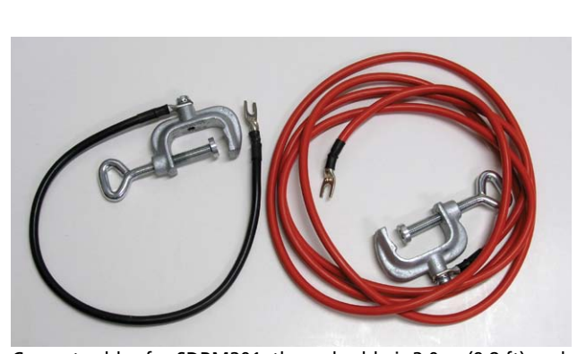
Current cables for SDRM201, the red cable is 3.0 m (9.8 ft) and the black one is 0.5 m (1.6 ft)