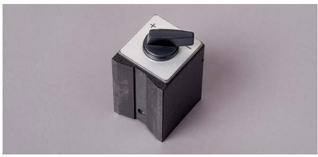
Switch magnetic base