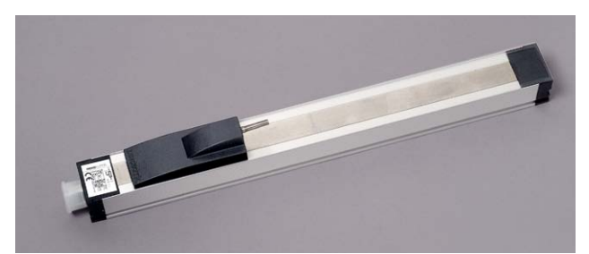
Linear transducer, TLH 225