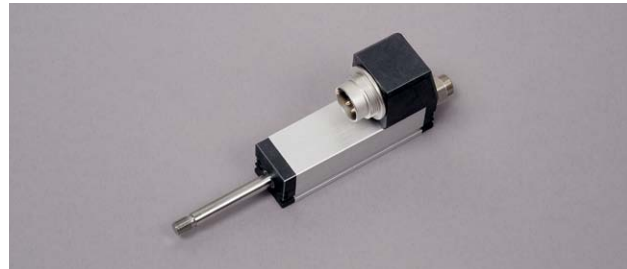
Linear transducer, TS 25