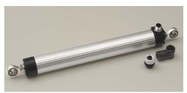
Linear transducer, LWG 150