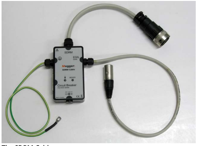
The SDRM Cable