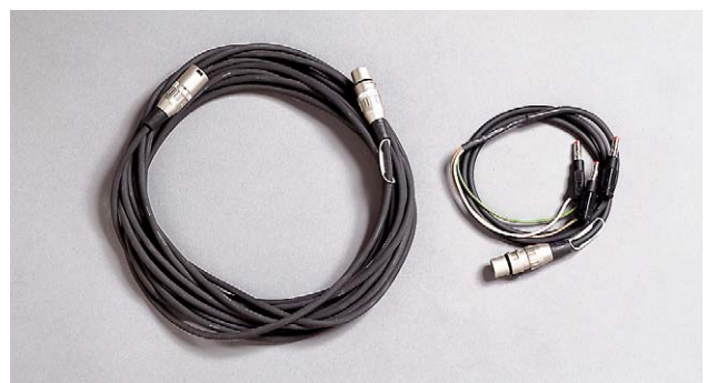
Transducer cables GA-00041 and GA-00042