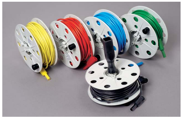
Cable reels, 20 m (65.5 ft), 4 mm stack-able safety plugs