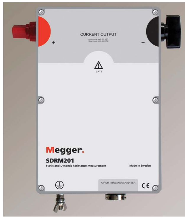
The SDRM201 is intended to use for both static and dynamic resistance measurements (SRM and DRM) on high voltage circuit breakers or other low resistive devices